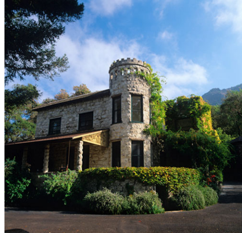
The Manor House, built in 1890

THE 2008 VINTAGE produced modest yields and exceptional wines for Stags' Leap. This growing season marked the second year of drought in the Napa Valley. The spring season was one of the driest on record with virtually no rainfall and precipitation was down 60 percent for the entire year. Summer produced cool, consistent temperatures, and the dry conditions forced the vines to focus on fruit development rather than leaf production producing a wonderfully concentrated crop. A brief warm spell around Labor Day added the boost of sugar development that we were looking for to complement the excellent acid structure in our Chardonnay.